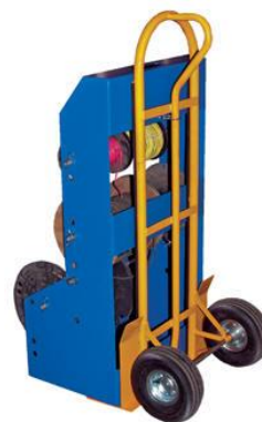
Hand Truck Kit with a Wire Reel Caddy