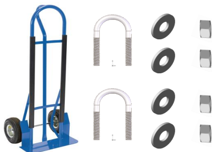
WIRE-D-SHD or WIRE-D-SHD-HR