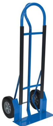
Hand Truck (hard rubber wheels), SPHT-500S-HD-HR Qty 1