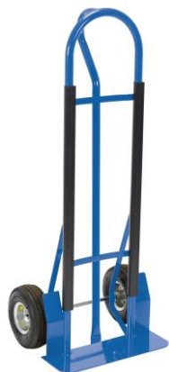
Hand Truck (pneumatic wheels), SPHT-500S-HD Qty 1